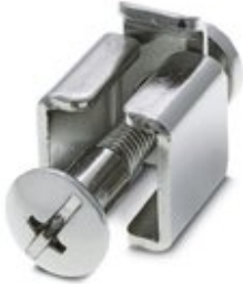
IPC mounting block style C. Compatible with BL FPM...

Please be informed that the data shown in this PDF Document is generated from our Online Catalog. Please find the complete data in the user's documentation. Our General Terms of Use for Downloads are valid ( http://phoenixcontact.com/download )